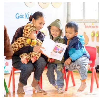
Kindergarteners and parents viewing the handbook