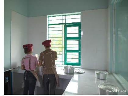
"We can stand up and cook, and we have a lot of cooking equipments, which is very helpful," a staff says