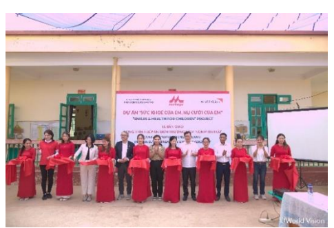
Ribbon cut at the handover ceremony