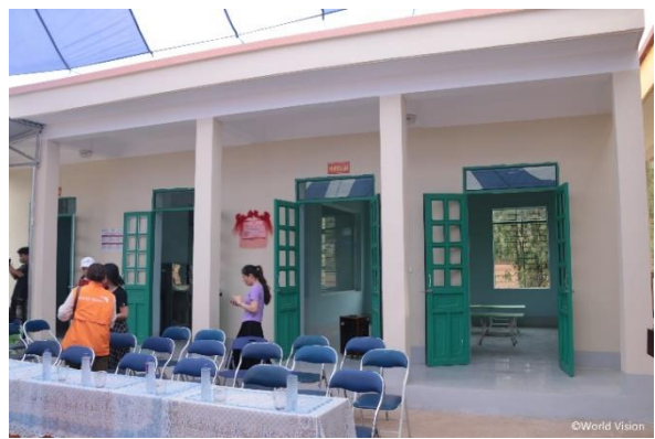
The new kitchen facility in the kindergarten